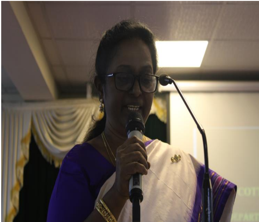
INTRODUCING OF CHIEF GUEST