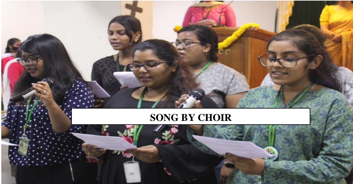
SONG BY CHOIR