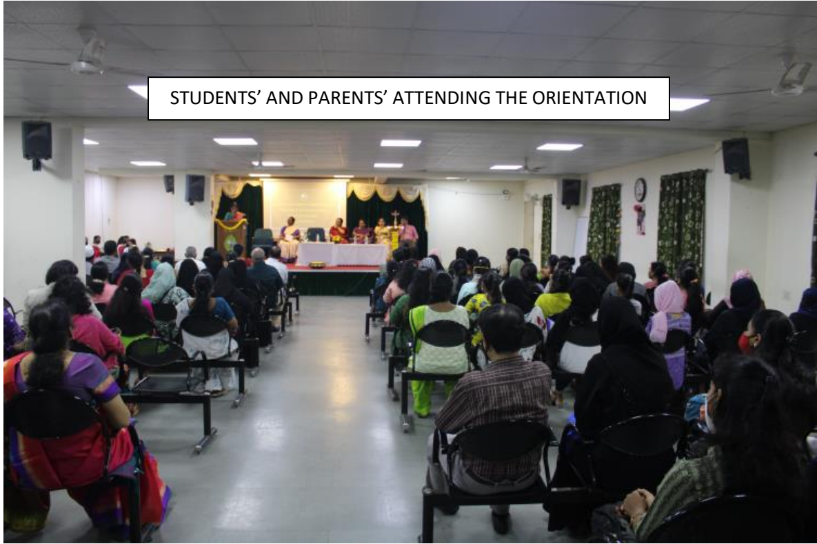
STUDENTS' AND PARENTS' ATTENDING THE ORIENTATION