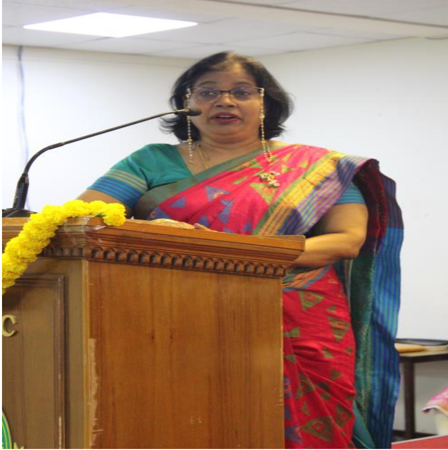
GUEST OF HONOUR ADDRESS