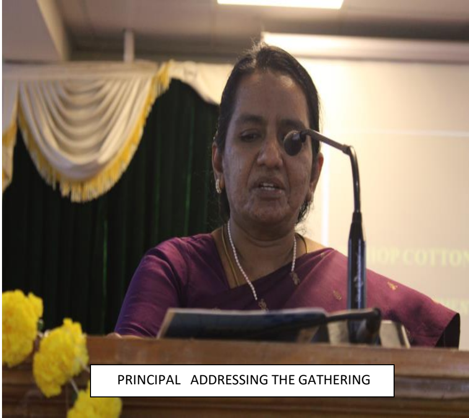
PRINCIPAL ADDRESSING THE GATHERING